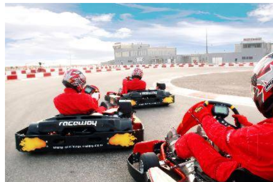
Junior Membership is available. Please see 'Junior Karting Activities' document.

Your personal Al Ain Raceway membership card, containing your individual membership number , will also gain you access to all the exclusive Member and VIP rates for any of Al Ain Raceway's special event formats throughout the year.